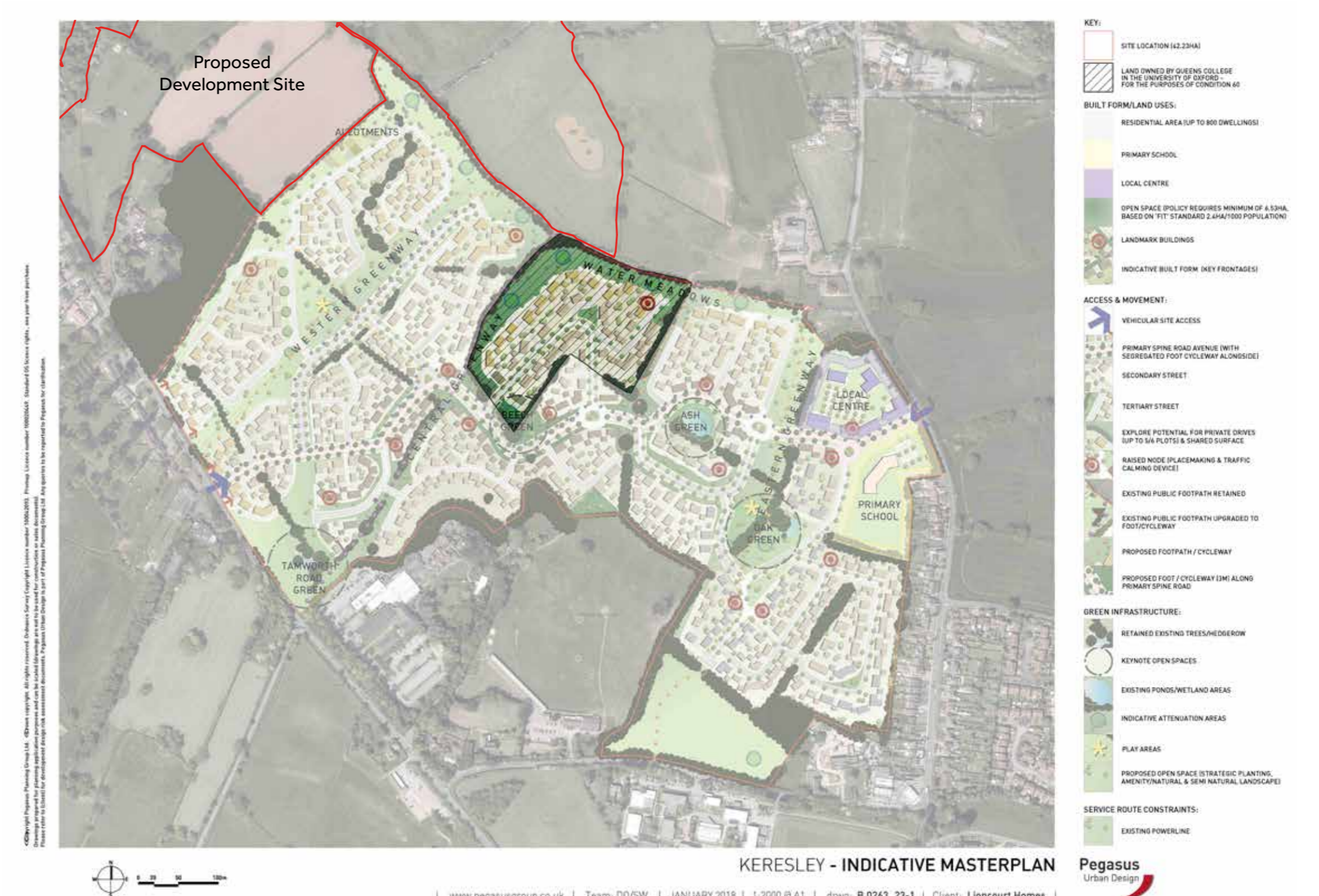
Pegasus, Masterplan for land south of the site Please note this plan is by others and is the most up to date accessed at the time of going to print.